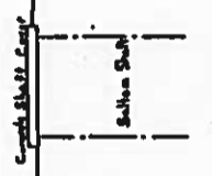
Section on A-B Scale - as plan Nov 77